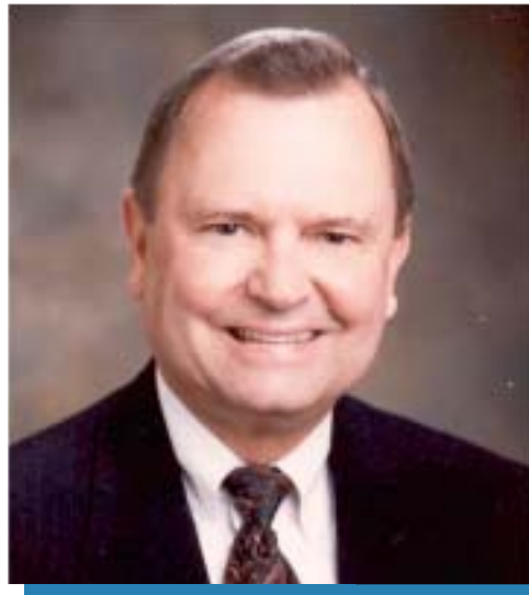
MS, CSP, CMC, CPCM Five Star Speaker